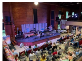
Silver Lake Experience July 30– August 1, 2026