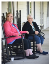
Women's Retreat August 16-18, 2026

Spend some time at camp, relaxing and having fun with engaging activities and worship while you learn and grow with God.