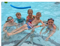
Asbury Express I ages 7-9