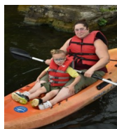
Together Time: A Family Retreat