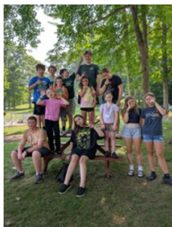
Asbury Express by Day ages 7-18

Once again, our generous United Women of Faith will help fund camp fees.