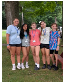
Asbury Express III ages 13-18