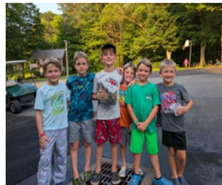
Asbury Express II ages 10-12